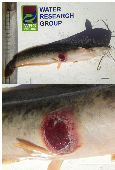
Fig. 2. Photographs of a lesion suspicious of epizootic ulcerative syndrome (EUS) on Clarias gariepinus from the Makuleke Wetlands.

single sharptooth catfish, Clarias gariepinus (Burchell, 1822) with a suspected EUS lesion (Fig. 2) was collected from the Nhlanguwe Pan (S 22° 22' 33.25" E 31° 12' 06.88"; Fig. 1) in the Limpopo River floodplain. The 2017 sampling trip was at the end of the summer high flow season with water levels already receding from the floodplains. Potentially, the single infected C. gariepinus could have been a remaining individual from a larger unrecorded outbreak during the preceding flooding period.