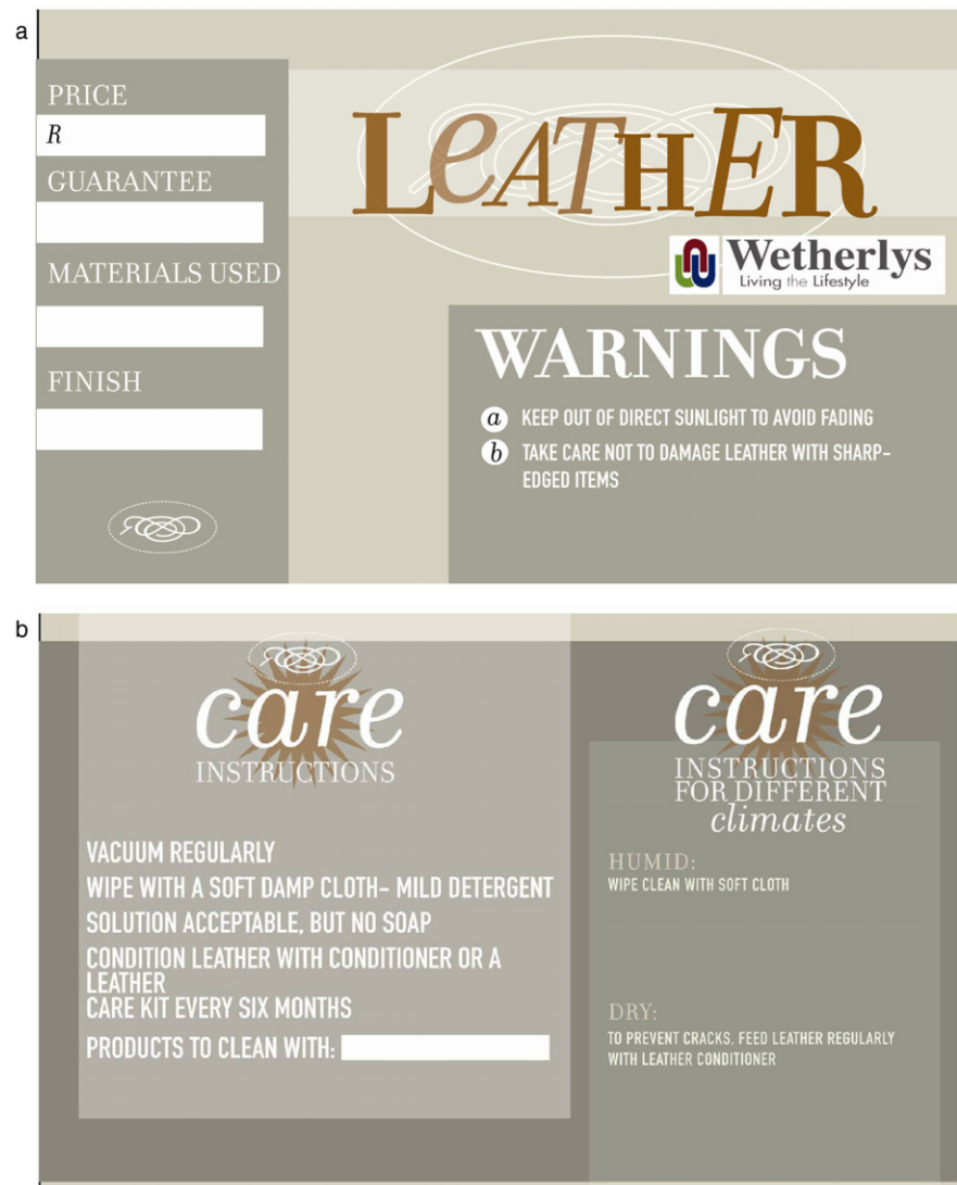
Figure 3 Label for leather furniture from the (a) front and (b) back.

and the information underneath (54.8%), and with only symbols for care instructions included (54.5%). More than 40% of respondents selected a medium-sized Arial, straight line, bold font for the headings and information, but preferred headings to be in upper-case. Results also showed that 41% of respondents expected the label to be visibly placed on the furniture item, similar to textile labels (Maqalika-Mokobori, 2005, p. 108), with the size depending on the item size (46.3%).