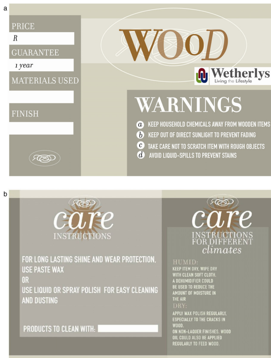
Figure 1 Label for wooden furniture from the (a) front and (b) back.

furniture based on eigenvalues larger than one (Field, 2005, p. 640), explaining 71.47%, 65.85% and 68.52% of variations respectively. Factor loadings larger than 0.4 were used to extract the attributes for each factor. The factors were related and consequently labelled according to literature regarding consumers' search criteria and expectations of furniture labels. The factors and items in each factor for all furniture types were labelled as value for money (price, guarantee and warranties), appearance (design, finish and type of item), maintenance (cleaning instructions, products to clean item with, care instructions for different climates and warnings) and production (country of origin and name of the manufacturer). Wooden furniture included a fifth factor, namely construction , with reference to materials used for production and the performance of the item. These two items, however, loaded as maintenance for upholstered furniture, and appearance for leather furniture, which