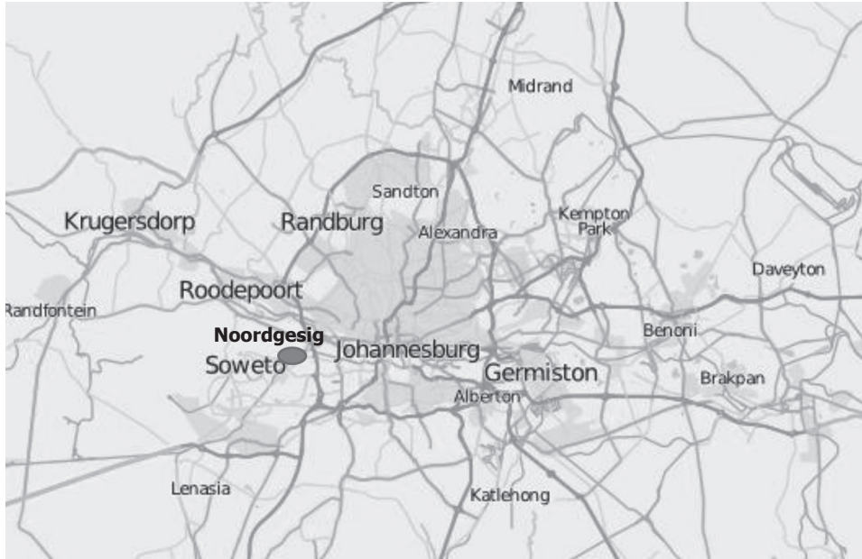
Image 1: The general location of Noordgesig (grey dot) in the greater Johannesburg region