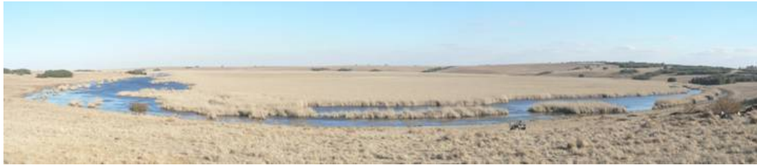
Figure 2: Panoramic view of Tevreden Pan

Tevreden Pan is home to diverse flora consisting of the reed bed, submerging species and shoreline species. The NWA defines a wetland, such as Tevreden Pan, as: