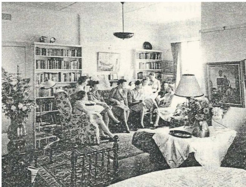
WOMEN'S CHARITY COMMITTEE