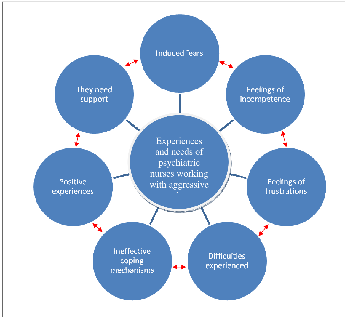
DIAGRAM 1: Experiences of psychiatric nurses working with aggressive patients