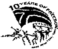
Acting APO Manager

We wish you all the best in your studies.