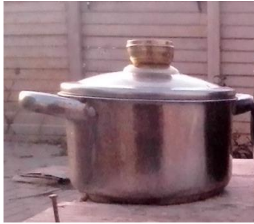
Fig.4: A photograph of the silver stainless steel cooking pot used in the experiments.

The total cost of the system is around R6,000 (USD 314) (Mawire et al., 2024). The PV system seems expensive, but for South African conditions it is reasonably priced considering that the system can be used as a multipurpose system with the capability of cooking, heating, cooling, and lighting applications. Only the cooking application is presented in this paper. Also, quality components and a large charging panel were used to make the price more expensive. The real price could be 50 % lower (USD 157) if a smaller solar panel and cheaper components were used (Mawire et al., 2024). The larger panel enables the charging of the battery faster, and it provides more versatility in terms of operating more DC devices.