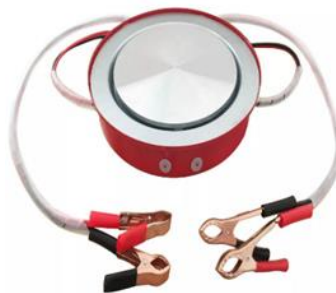
Fig. 1: A photograph of the 12 V DC cooker used in the experimental test (Takealot, 2023)

A photograph of the 12 V DC cooker with four terminals is shown in Fig. 1 (Takealot, 2023). The cooker has two coils indicated by the four terminals in Fig. 1. It implements DC heating at two powers of approximately 200 W and 300W. The heating powers are estimated from the measured resistances of the single coil and the two coils which are 0.8 \Omega and 0.6 \Omega , respectively. For 200 W, one coil consisting of two terminals (red and black) is connected to the 12 V battery/source. For the 300 W setting, the two red terminals are connected to the positive terminal of the battery/source, and the other two black terminals are connected to the negative terminal of the battery/source. The cooking surface of the DC stove is 16.7 cm in diameter, and its height is 5.5 cm. The total diameter of the cooker is 23 cm.