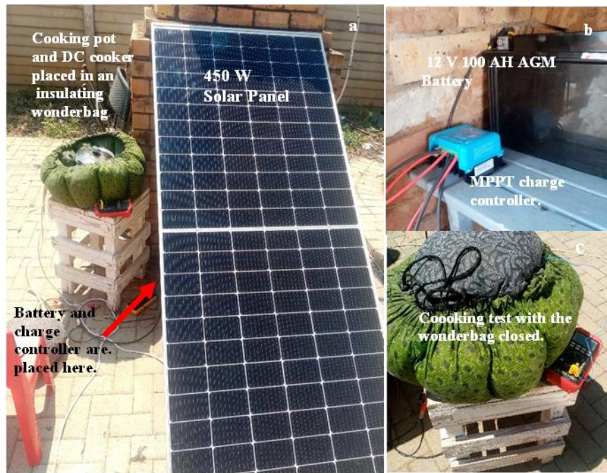
Fig. 3: Photographs of the experimental setup showing (a) the PV panel connected to the DC cooker in a wonderbag, (b) the 12 V AGM battery and the MPPT controller, and (c) a closed wonderbag with the DC cooker and the cooking pot with food.

Fig. 4 shows a photograph of the silver stainless steel cooking pot used as a cooking utensil enclosed in the wonderbag. It has an outer diameter of 21cm and a height of 10 cm, making its capacity 3.5 litres