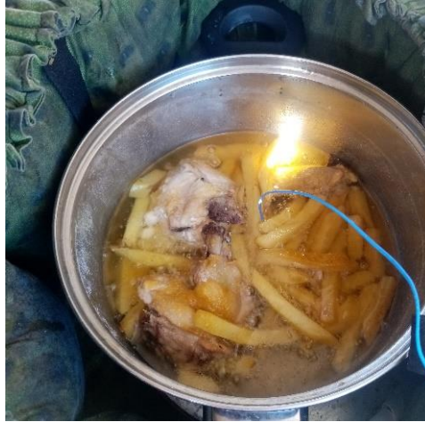
Fig. 6: Chicken and chips (fries) cooked using the solar PV-powered DC stove.

Fig.6 shows crispy and well-cooked chicken and chips (fries) using the solar PV-powered DC stove.