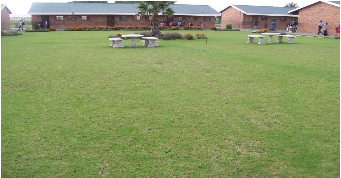
Figure 3.5: Surroundings in school D

The school has a roll of 1364 learners. The number of educators is 40 including the SMT members, with 15 males and 25 females. The number of SMT members is 8, including a male principal, a male and a female deputy principal and 3 male and 2 female Heads of Departments.