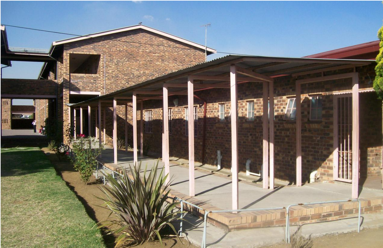
Figure 3.4: Surroundings in school C

The photo shows the surroundings of school C, the administration block and a double storey building of classes.