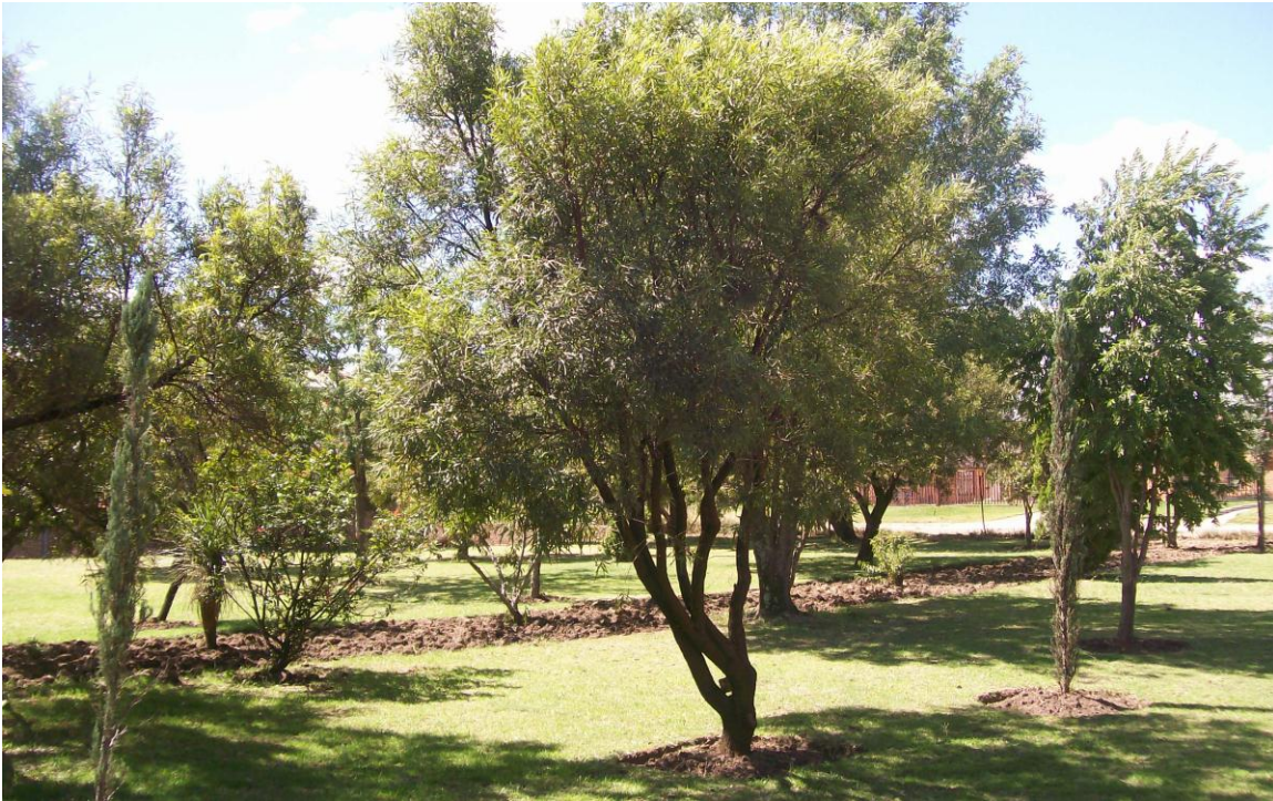
Figure 3.2: Surroundings in school A

The photo indicates the well kept surroundings, the trees and well maintained lawn.