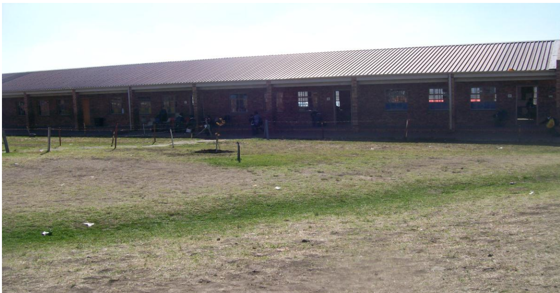
Figure 3.3: Surroundings in school B

The school was established in 1994 and has an enrolment number of 1057 learners, and 33 teachers including the SMT. The male and female split is; 6 male and 27 female teachers. The SMT members are 8, with 3 males and 5 females, including a male principal, and a male and female deputy principal. Although the school had spacious surroundings the vegetable garden was unattended to. The trees are still small, there is no grass, only the ground throughout the premises. The wire fence is still intact, except for minor maintenance that should be made.