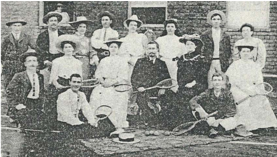
ELANDSFONTEIN NUMBER 289 TENNIS CLUB, 1910

As far as is known, tennis was played at the farm Elandsfontein number 289 since 1910 and subsequently at Wonderfontein and at the settlement at Klipdrift as well. This type of sport was largely aimed at relaxation. 35 For the maintenance of the tennis courts, club membership fees were collected. In 1926, membership fees of the tennis club at Wonderfontein amounted to eight shillings per annum and admission fees for non-members were five shillings per match. 36 The recreation club of the Blyvooruitzicht Mine also made provision for tennis facilities. 37