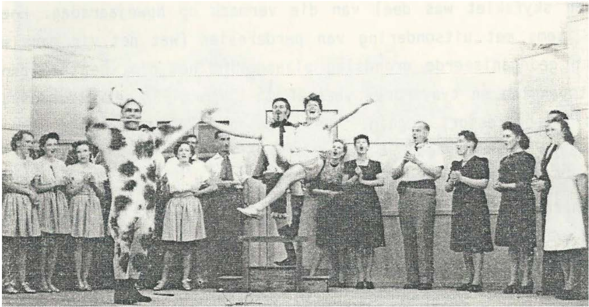
BLYVOOR AMATEUR DRAMATIC SOCIETY