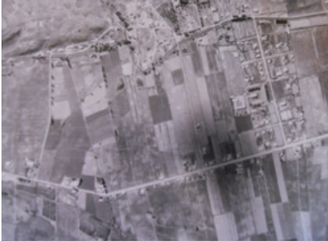
Image 4: An aerial view of the typical, long, rectangular-shaped irrigation lots at Bonnievale. The town lies between the road and the canal towards to top end of the photo