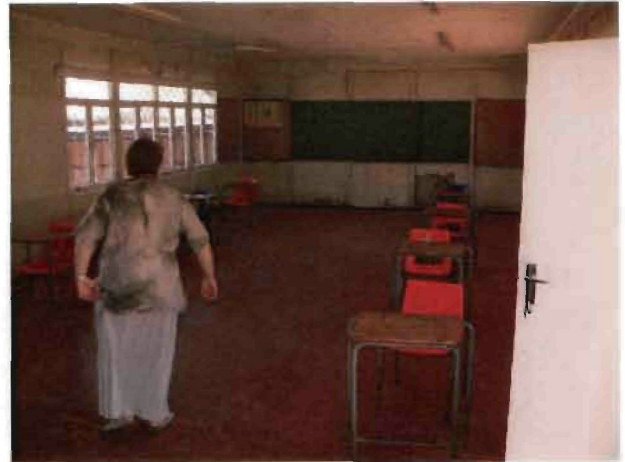
Photo 8: Siyalungelwa Life Science and Physical Science laboratory room before it was fixed