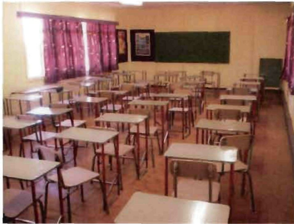
Photo 9: Siyalungelwa new Life Science and Physical Science laboratory room