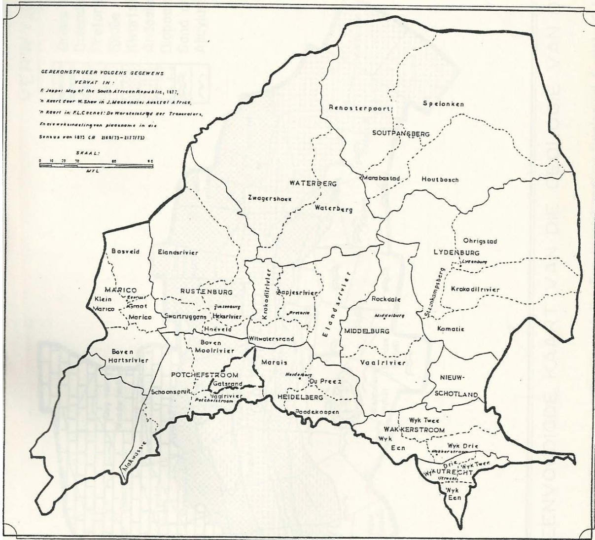
MAP 1 LOCATION OF GATSRAND