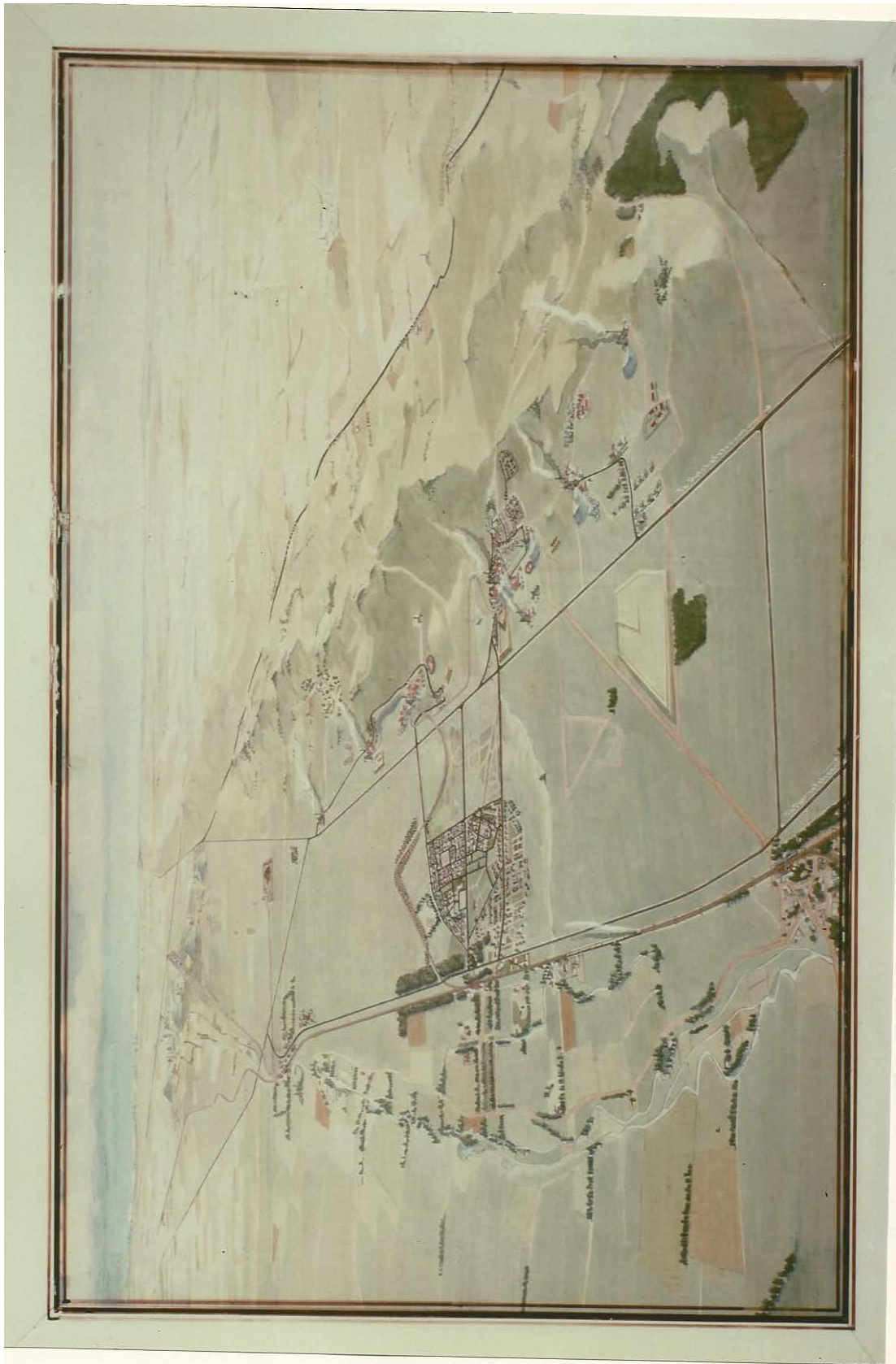
AN AERIAL PHOTOGRAPH OF CARLETONVILLE AND ENVIRONS CIRCA 1950