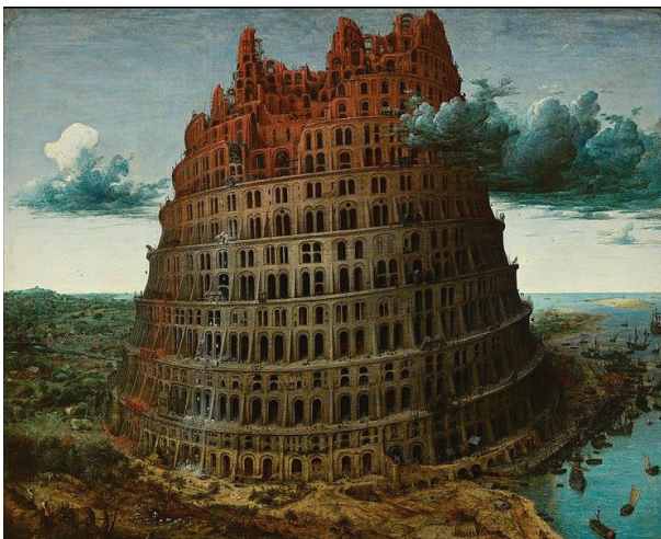
Figure 3: Rotterdam ‘The Tower of Babel’ by Pieter Bruegel the Elder (1563b)