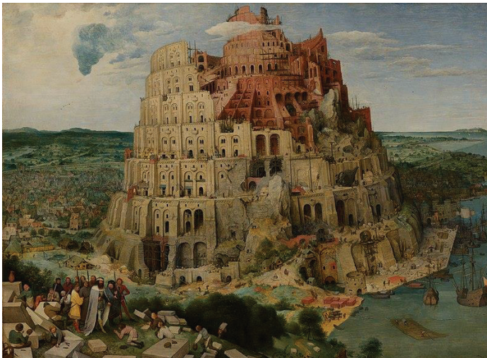
Figure 1: Vienna ‘The Tower of Babel’ by Pieter Bruegel the Elder (1563a)

In approaching the reality of diversity and multilingualism the painting The Tower of Babel by Pieter Bruegel the Elder (1563) is considered.