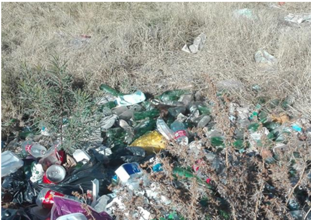
Figure 1: Disposal of plastics and food packaging in Greater-Taung

Plastic waste refers to waste that is generated as a result of plastic products. Plastics are a big problem in the environment due to its non-biodegradability. 64 Plastic merely breaks down or dissolves into smaller particles and remains in the atmosphere in the form of microplastics and nanoplastics, which are then consumed by animals, birds, insects as well as humans. 65 The toxicity level of plastics is dependent on its chemical composition. 66