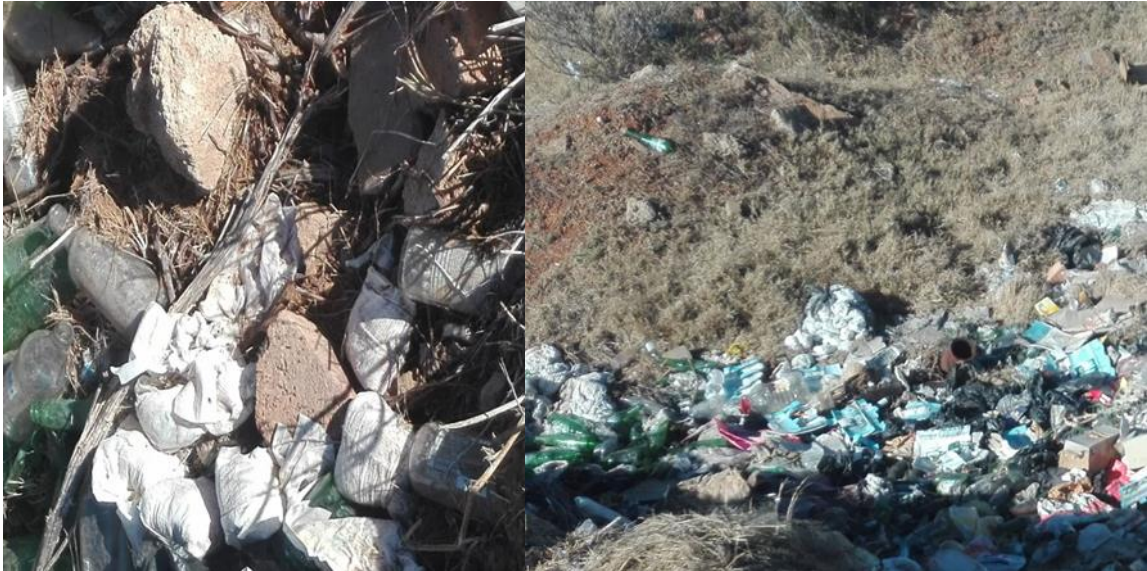
Figure 2: Disposable nappies in an open field 81

cases, it may result in death. 78 The health risk poses socio-economic challenges to poor communities that have limited access to health care facilities. 79 This waste also puts significant strain on local governments responsible for its disposal and management. 80