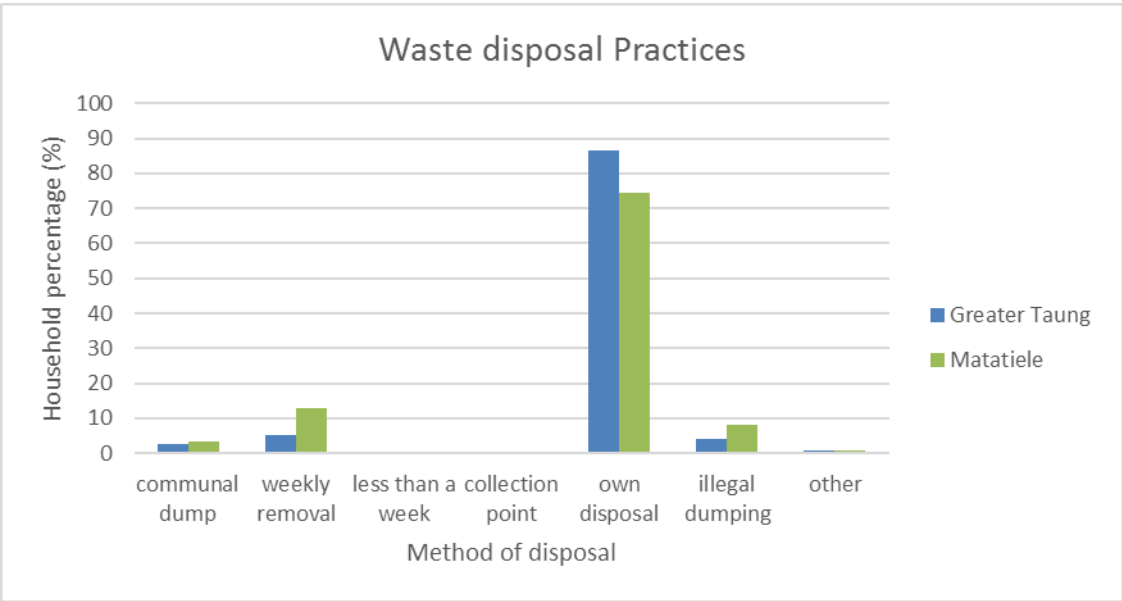
Figure 6: Waste disposal practices in Greater Taung and Matatiele

The following graph depicts the waste collection services in Greater Taung Local Municipality and Matatiele Local Municipality, based on the 2016 StatsSA community survey: 450