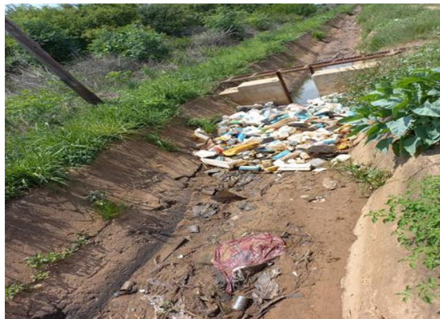
Figure 3: Disposal of waste containing disposable nappies in a water canal 91

provide basic waste removal services to low-income households. 86 Each municipality was given the discretion to determine criteria for households that would qualify for the service. 87 However, sometimes municipal waste collection services do not reach people because of a failure on the part of local government to provide such services. 88 In 2021, it was estimated that a weekly municipal waste removal service was available to only 60.3% of South African households. 89 This prompts people in affected communities to get rid of waste themselves, often leading to the improper disposal of waste at dumpsites and in or near water sources. 90