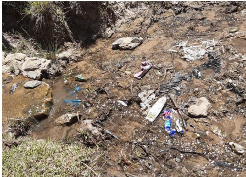
Figure 4: Disposal of waste at a natural spring in rural Matatiele

comply with chemical determinants, such as arsenic, lead and mercury. 113 Such failure may lead to acute or chronic health complications for communities consuming the water and makes the water unfit for use in energy and food sectors. 114