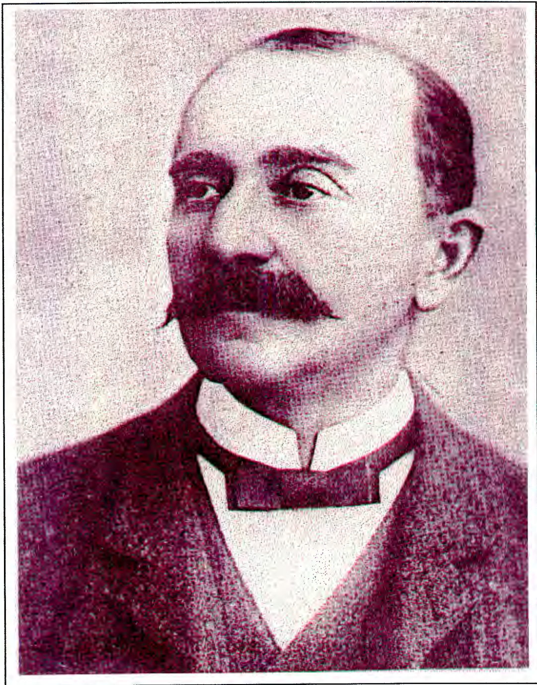
Alois Hugo Nellmapius (1847-1893), (foto ongeveer 1890 geneem)