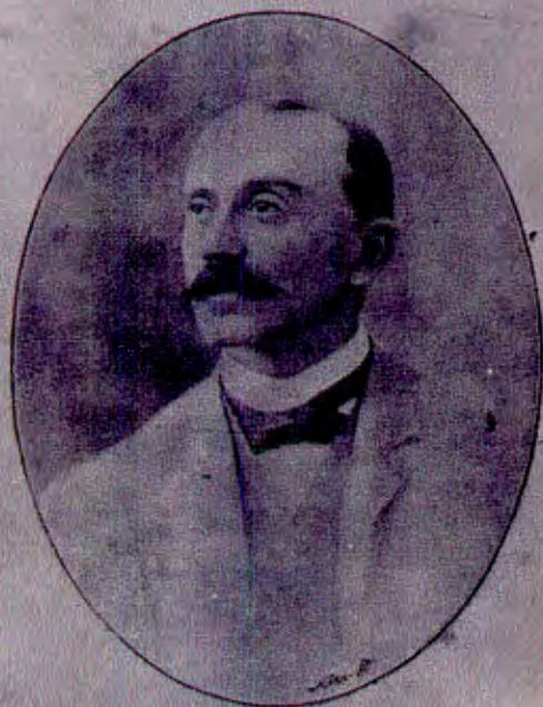
ALOIS HUGO NELLMAPIUS

De ware vriend van het Volk der Z. A. Republiek.