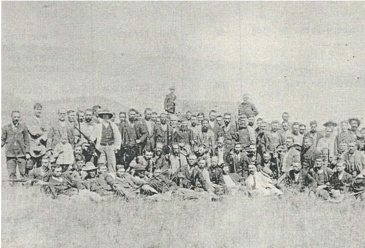
MEMBERS OF THE LOSBERG RIFLE CLUB, 1920

Wage disputes between white and black labourers gave rise to a strike at the Rand gold mines in 1913. Units of the new defence force, inter alia, the Gatsrand Commando, were called up for service. 125 They had to protect mines, municipal buildings, railway stations, power stations and specific private property against unrest and disorder. 126