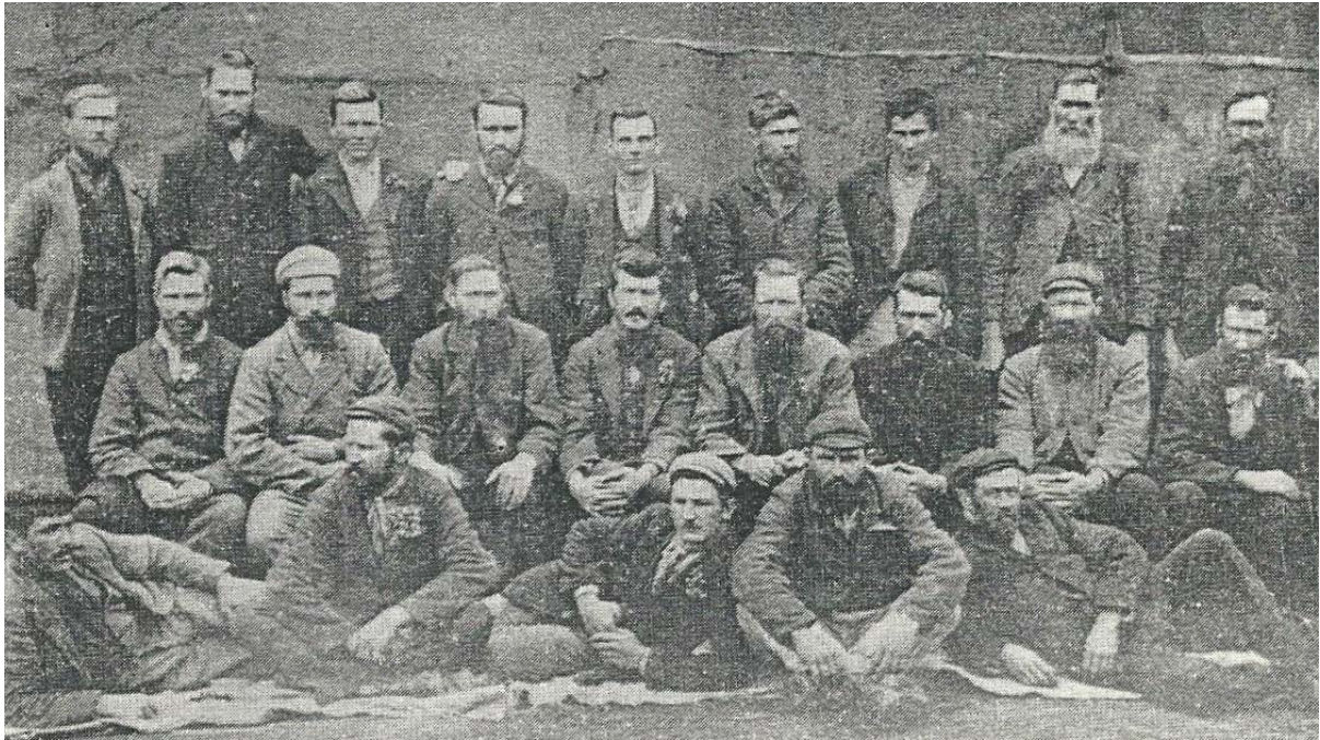
SOME OF THE GATSRAND BURGERS IN THE PRISONER-OF-WAR CAMP ON ST. HELENA, 1900