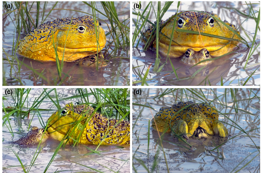
FIGURE 2 Pyxicephalus beytelli breeding. (a, b) Amplecting pairs; (c) Female approaching a male; (d) spawning, eggs floating on surface.