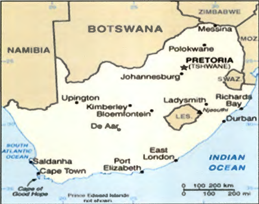
Figure 2: South African map with surrounding borders and relevant borders (Google, 2016).

This map of South Africa illustrated the above mentioned borders surrounding South Africa.