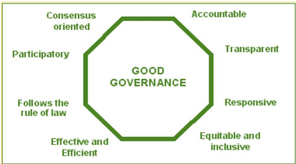
Figure 3.1: Principles of Good Governance