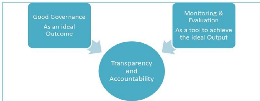
Figure 2 Linking good governance to M&E