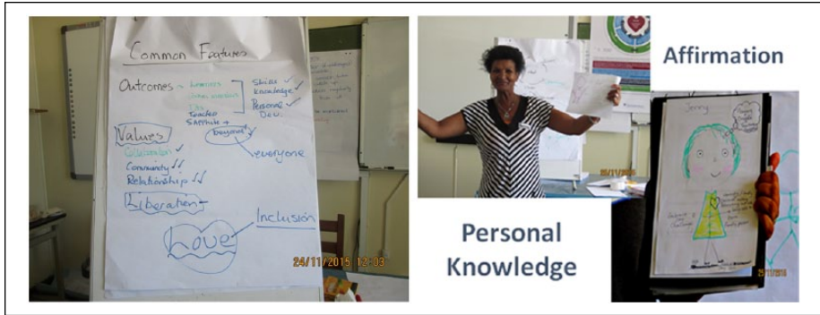
Figure 1. Making local knowledge explicit.

The best exercise was when we had to draw ourselves—after that I felt I had something good to give to this project that I did not know before. (TA 3)