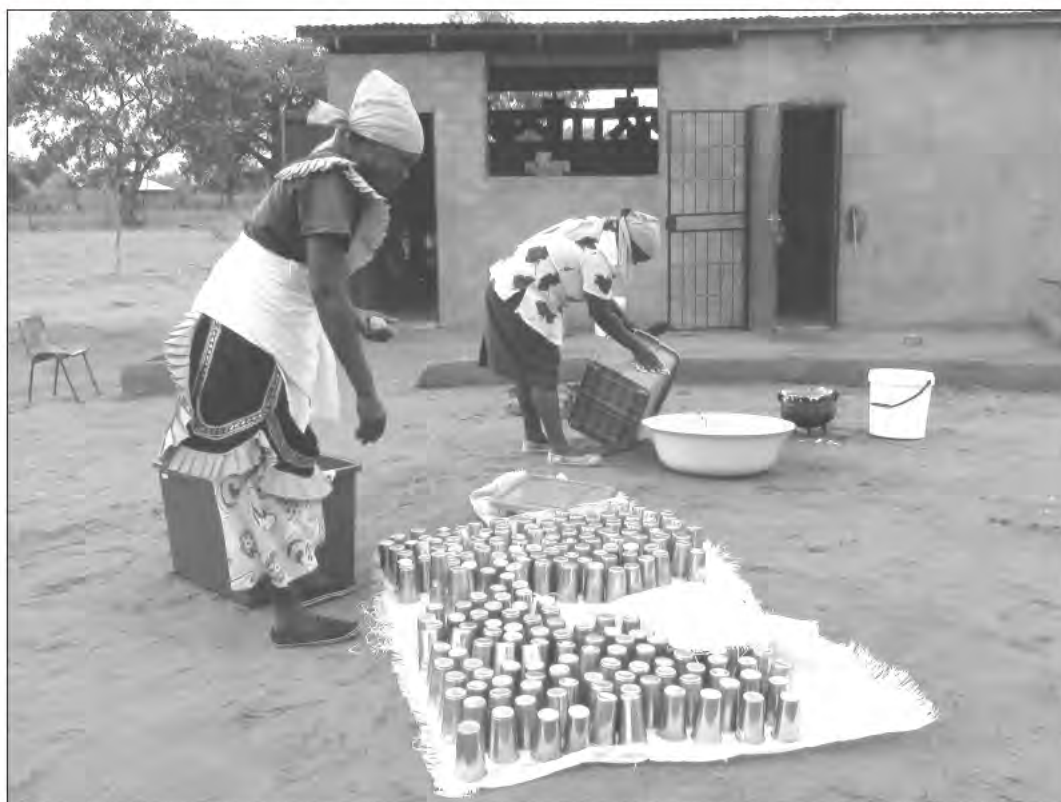
Plate 1. Cooks at a feeding scheme, Tshiungani Primary School, Limpopo Valley, 11 June 2009