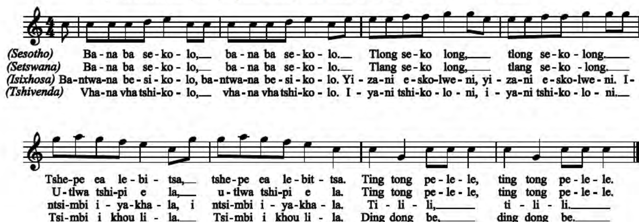
Fig. 4. Frère Jacques : popular form in African languages in South Africa 16

Children of the school, children of the school. Come to school, come to school. Hear the school bell ringing, hear the school bell ringing.