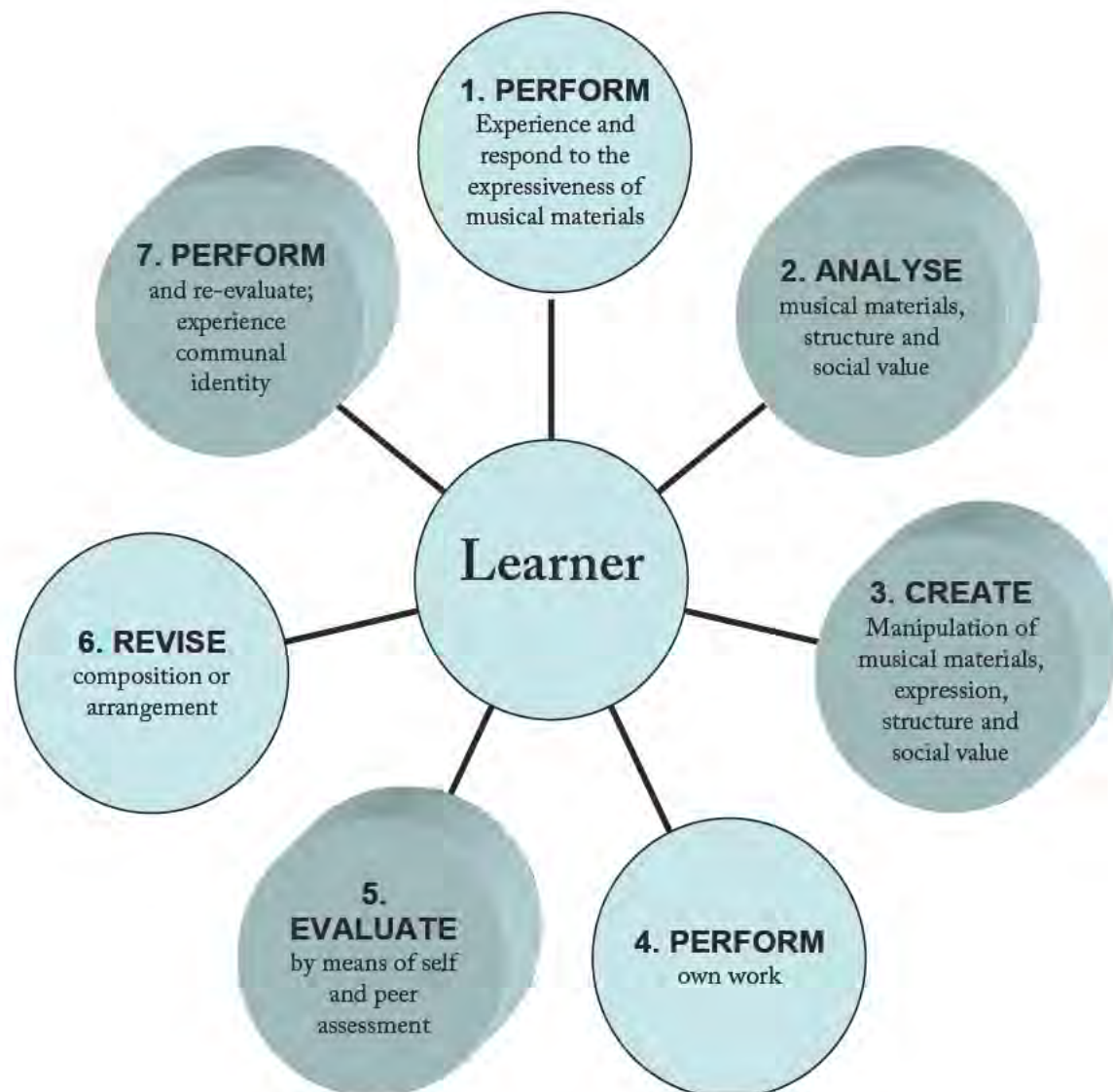
Fig. 1. Strategy for cultivating higher order thinking in music education, synthesised from Anderson and Krathwohl (2002:214), and Swanwick (1991:155)

Learners are guided to understand that musical products have adaptive, strategic use, and that adjustment to their structure and meanings may be an ongoing process.