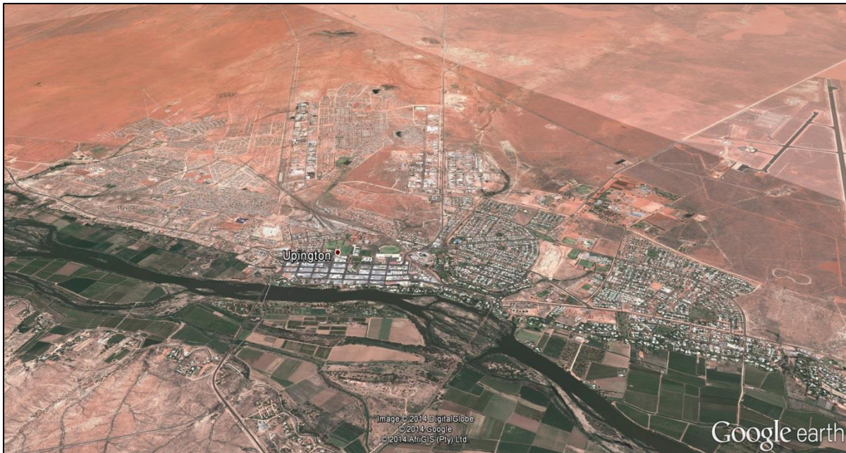
Figure 2: The town of Uppington, Northern Cape Province

The extent of the study area is 24,8 ha and accommodates 100 erven used as businesses and offices. All roads accommodate motorised vehicles and prioritise it as superior to non-motorised transportation modes. An aerial view of the town can be seen as Figure 2.