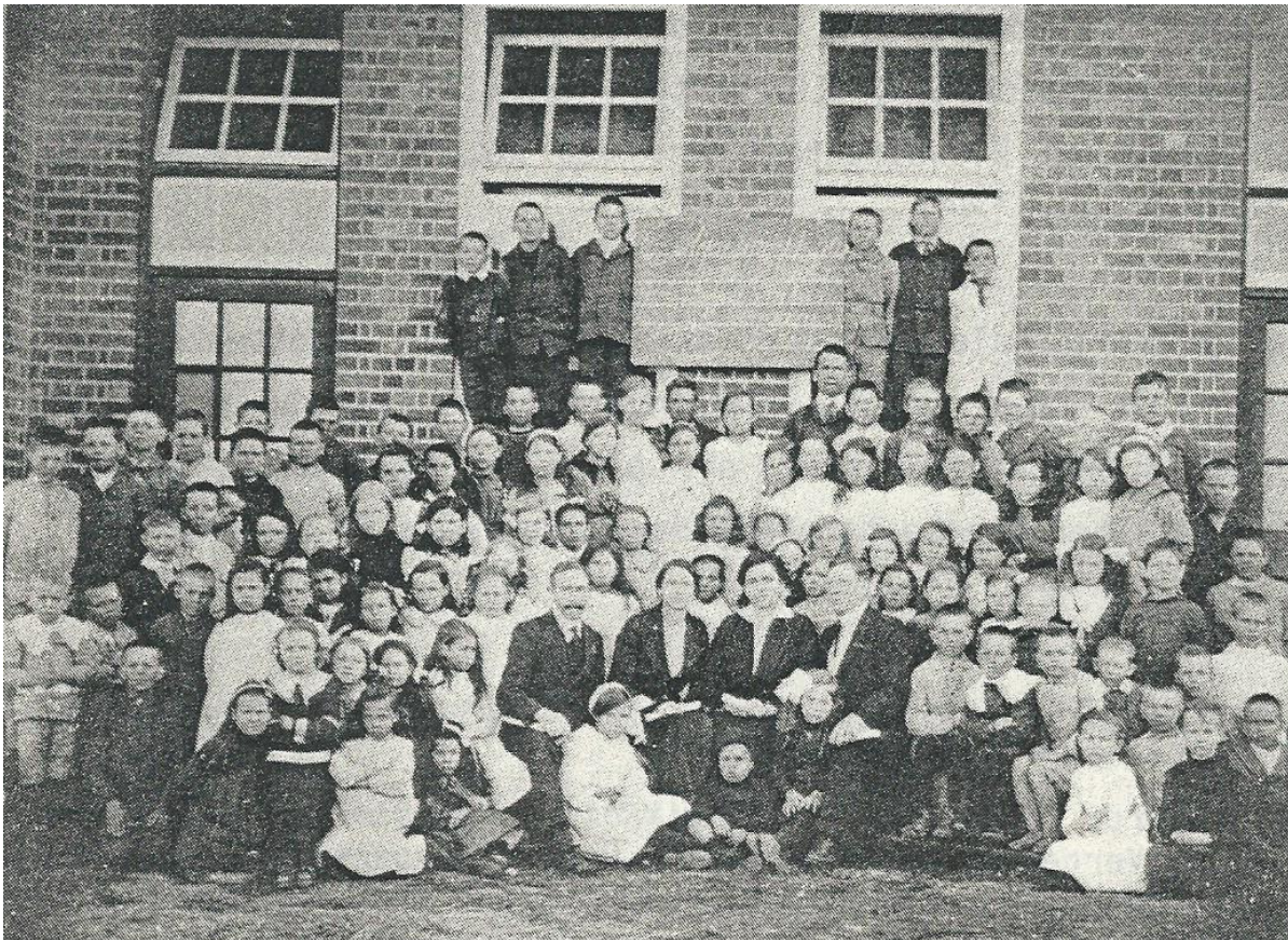
PUPILS AND STAFF OF THE ROOIPOORT 50 SCHOOL, 1916

To some of the farm schools poor attendance served as the deathblow. Long distances to schools and the apathy of parents towards schooling caused them to rather use their children as labourers on the farms on account of a labour shortage. This contributed to the threat to the right of existence of some schools. 30