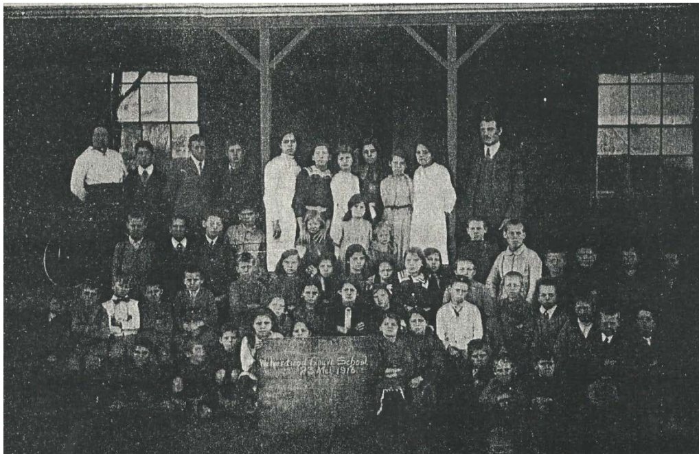
PUPILS AND STAFF OF THE WELVERDIEND SCHOOL IN 1916 Photo: BJV Naudé (ed.), Commemorative Edition: Receipt of mail coach

Language Ordinance Number 5 of 1911 placed both languages (English and Afrikaans) on an equal footing at school level – something by which the Afrikaans-speaking children in the Gatsrand undoubtedly benefitted. 47 The inspection reports of schools such as Elandsfontein number 289, Welverdiend 48 and Klein Losberg were full of praise after 1911 for the progress that children made in these schools.