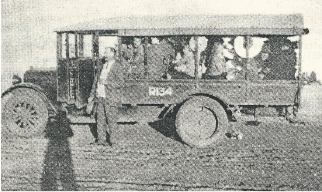
THE SCHOOL BUS OF ELANDSFONTEIN NUMBER 289, CIRCA 1930

There were also complaints about the children's having to make do with water through which cattle was herded daily. Parents tried to help by covering the earthen floors with carpeting. 78