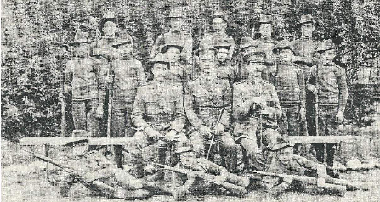
PUPILS AND OFFICERS OF ELANDSFONTEIN NUMBER 289 DURING A SCHOOL CADET GATHERING IN POTCHEFSTROOM, 1917

The school at Wonderfontein only started playing rugby and corfball after an increase in the number of pupils from 1940. 90