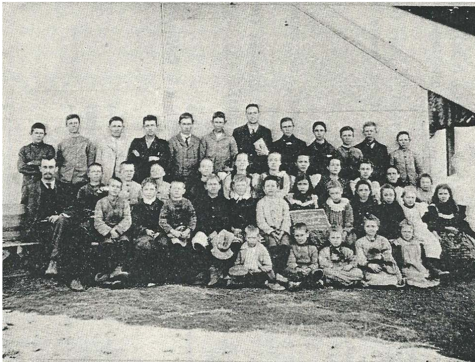
PUPILS AND STAFF OF THE SCHOOL ELANDSFONTEIN NUMBER 289, 1904

Children were taught biblical history and the elementary subjects – the three Rs (reading, writing and arithmetic). Attention was also given to singing. 17 According to inspection reports of schools in the Gatsrand, it would seem that the inspector found teaching in the area to be elementary, yet functional. 18