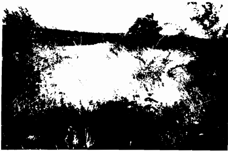
Plate 1 : Plot 1109 (A)