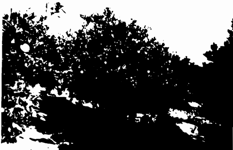
Plate 3 : Plot H 336 (C)