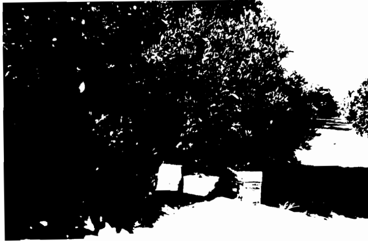
Plate 4 : Plot 117 (D)