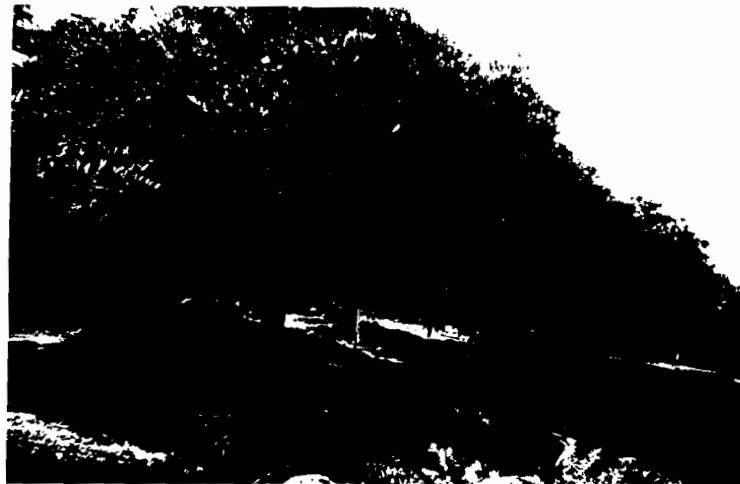
Plate 5 : Plot 116 (E)