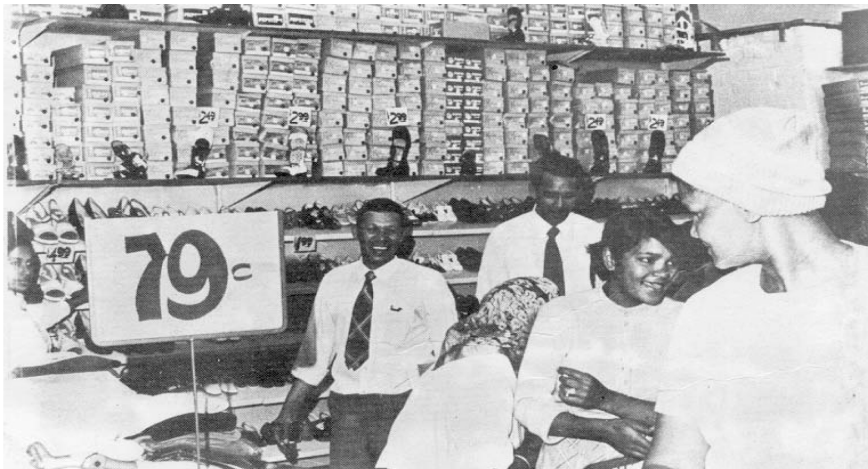
Image 7 & 8: Customers at the opening of the second Pep Stores Peninsula branch in Elsievier