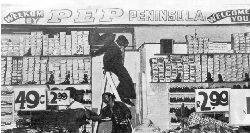
Image 4: Preparations for the opening of the Pep Stores Peninsula branch in Elsiesriver