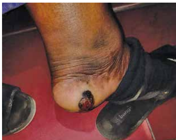
Melanoma in foot of Black African woman

inform prevention campaigns. Workplace-based health practitioners and primary care physicians will need to be provided with the tools and incentives to assess and refer cases of occupational skin diseases to dermatologists. Dialogue between employers, employees, trade unions and insurance/compensation schemes will need to be initiated.