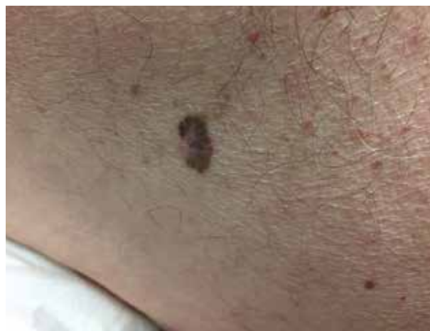
Superficial spreading MM in White skin

Mandatory screening of working populations at highest risk of excess sun exposure for early detection of occupational solar UVR-induced skin cancer may be important. A notification system at national level will also help to track skin cancer prevalence and