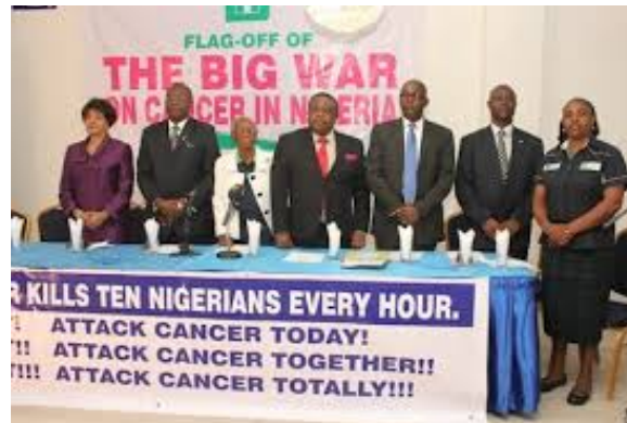
Figure 5: Photo Story of Media Awareness Campaign against Cancer

of the primary sources of information about breast cancer because they provide reports on the nature and dangers of disease in the society.