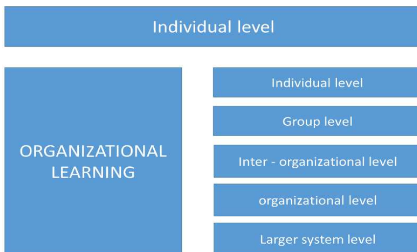
Fig. 2. The flow of learning across levels

Organizational learning is multilevel (e.g., individual, group, organizational and inter-organizational), and it is, therefore, important that organizations consider the flow of learning across all levels (Crossan, Lane, White and Djurfeldt, 1995).