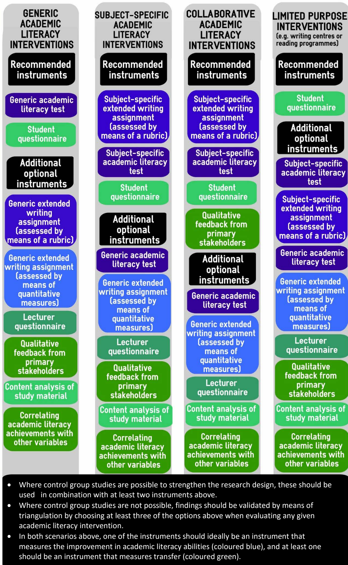
Figure 2: Proposed evaluation design for academic literacy interventions