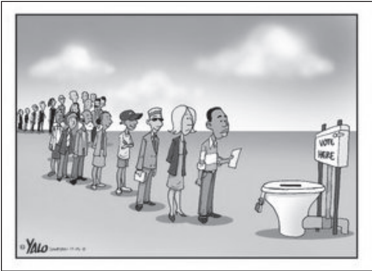
Figure 2: Yalo, in Sowetan , suggested it was all about the vote. 15

We don't accept that the city has no funds to build proper toilets for our people, as we know that Cape Town has got the best suburbs in the country, comparable to the best in the world. 14