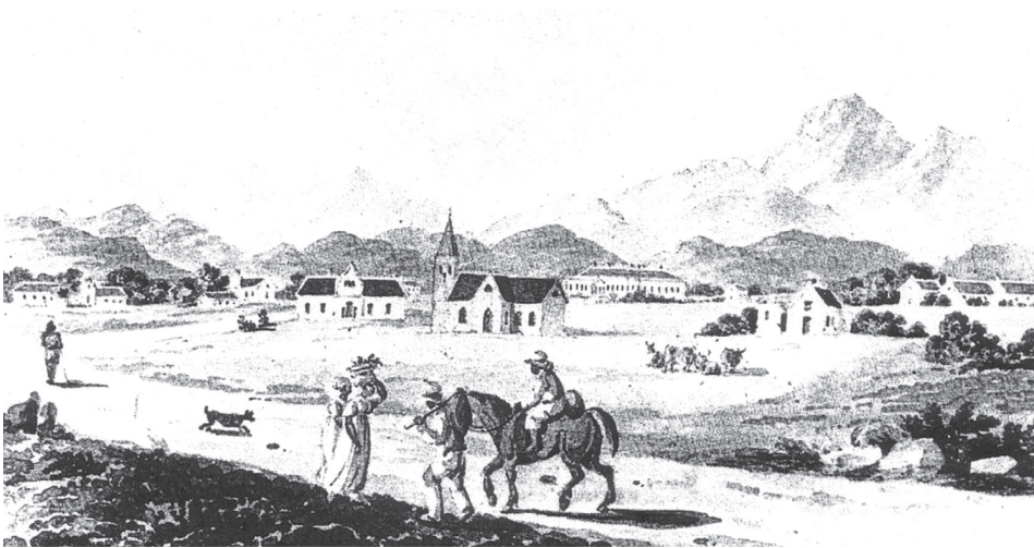
Image 1: Worcester in about 1833, showing Dutch Reformed and Lutheran Churches

Source: C D'Oyley, H Fransen, Old towns and villages of the Cape: A survey of the origin and development of towns, villages, and hamlets of the Cape of Good Hope (Jeppestown, Jonathan Ball, 2006), p. 177.