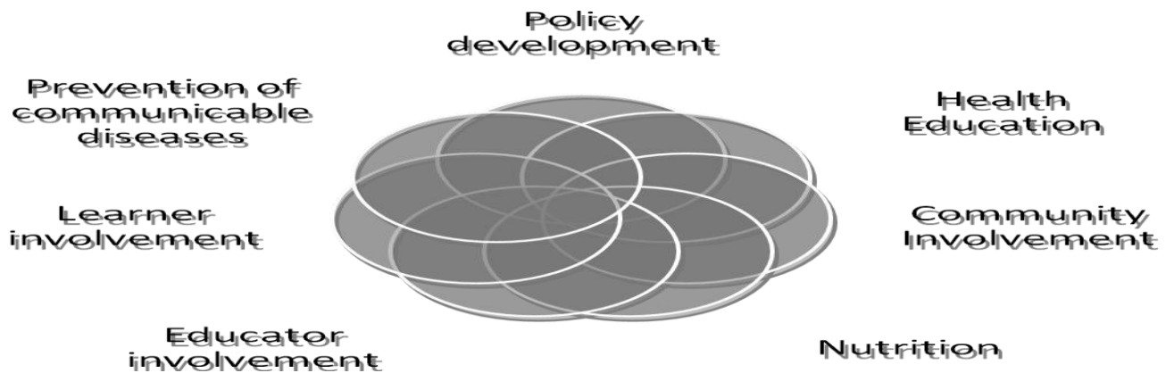
Figure 2.2: Determinants of health promotion

The diagram indicates that these strategies are intertwined to such an extent that one strategy relies on all others to be effective. This could mean that educators depend on the availability of programmes such as school nutrition and the support of the