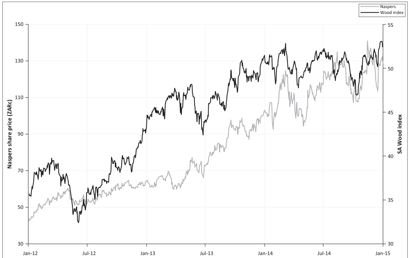
FIGURE 1-A1: Correlation example ( \rho = +0.92 ).