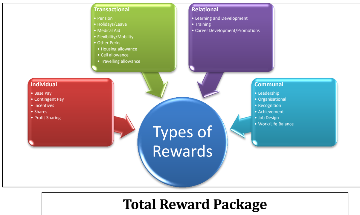
Figure 1. Total reward package (Torrington et al., 2008)

In this study rewards, compensation (a term more generally used in the US) and remuneration (more generally used in SA) are used interchangeably with the purpose of being all-inclusive of the construct ‘money’ and all its dimensions. The fundamental reason why people engage in workmanship, is in order to receive some form of remuneration; it being the nucleus of any employment relationship (Glassman, Glassman, Champagne, & Zugelder, 2010).